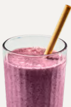
Açaí Protein Punch (26g of Protein)

Oat Milk, Vegan Protein, Açaí, Almond Butter, Banana, Blueberries, Organic Agave Nectar