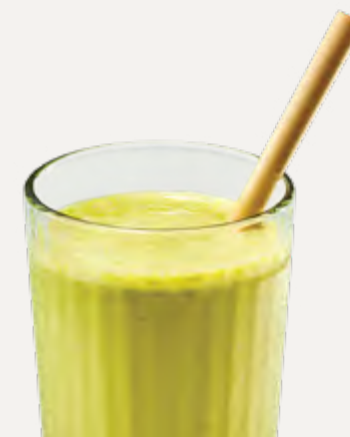
PB Protein (31g of Protein)

Oat Milk, Banana, Strawberries, Organic Agave Nectar